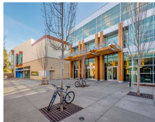
SSU Recreation Center

Mon-Thurs: 6:00am - 12:00am Friday: 6:00am - 10:00pm Saturday: 9:00am - 10:00pm Sunday: 9:00 am - 12:00 am