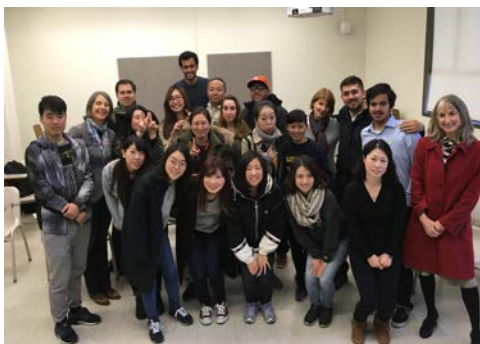
SSALI students and teachers