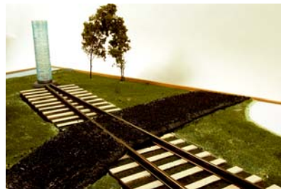
The Erna & Arthur Salm Holocaust and Genocide Memorial Grove